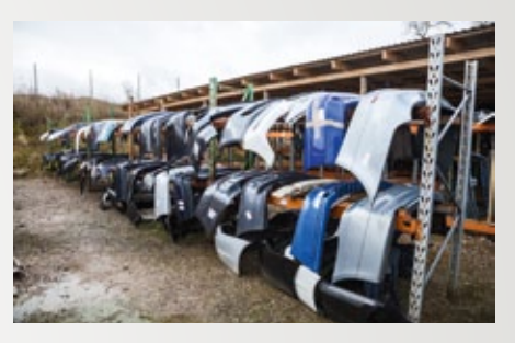
BUMPERS and body parts are also in stock. Although it is only plastic bumpers that are placed outside.