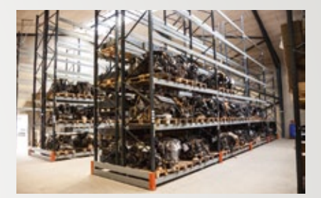
IT is overwhelming to see this many engines in stock and if you are interested in BMW do not drive to Nordborg without bringing your wallet, because this is the