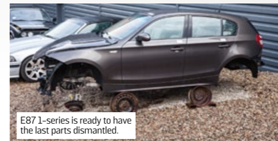
E87 1-series is ready to have the last parts dismantled.

SCHMIEDMANN NORDBORO is ISO 9000 certified, which assures top quality on the cars being scrapped. The yard is always filled with approximately 300 damaged cars.