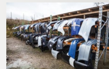
BUMPERS and body parts are also in stock. Although it is only plastic bumpers that are placed outside.