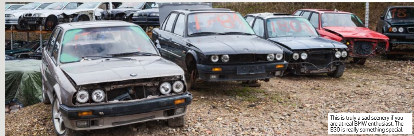
This is truly a sad scenery if you are a real BMW enthusiast. The E30 is really something special.