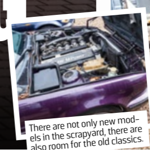
There are not only new models in the scrapyards, there are also room for the old classics.

IT is overwhelming to see this many engines in stock and if you are interested in BMW do not drive to Nordborg without bringing your wallet, because this is the place for crazy impulse buying.