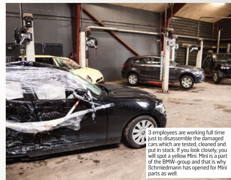
3 employees are working full time just to disassemble the damaged cars which are tested, cleaned and put in stock. If you look closely, you will spot a yellow Mini. Mini is a part of the BMW-group and that is why Schmiedmann has opened for Mini parts as well.