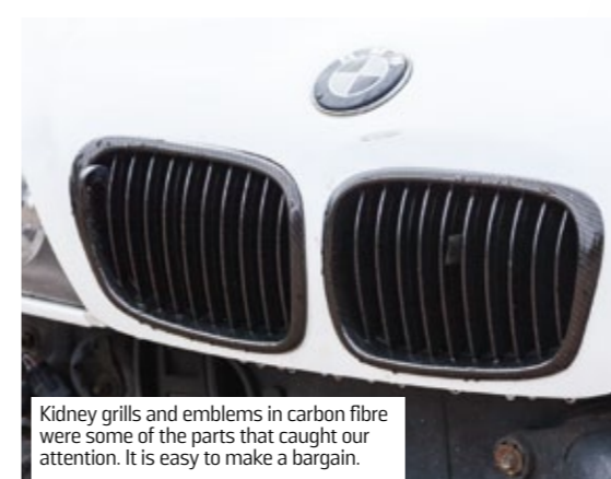
Kidney grills and emblems in carbon fibre were some of the parts that caught our attention. It is easy to make a bargain.