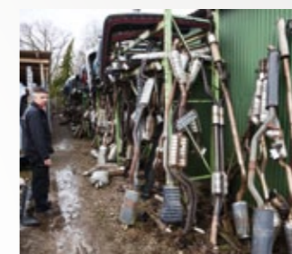
EXHAUSTS of every kind and model are lined up. Also performance exhausts.

IF YOU think Schmiedmann Nordborg is a graveyard for cars, you are wrong. Every year they have 400 cars through the scrapyards workshop, and that is why the cars do not take root. Right now there are 300 cars in the yard..