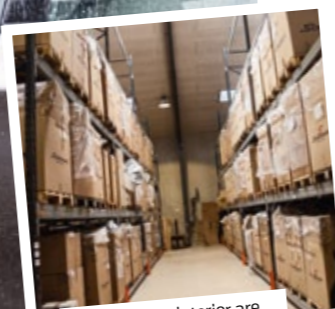
The complete interior are photographed and packed in these big boxes for immediately delivery.