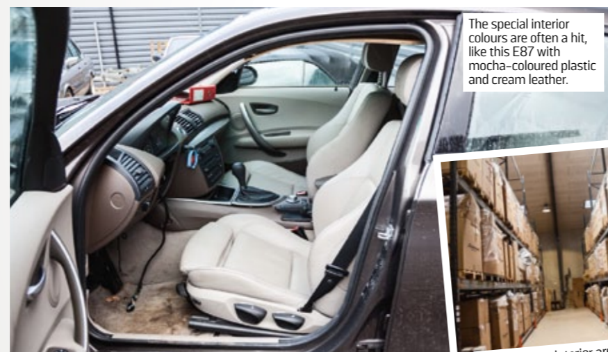
The special interior colours are often a hit, like this E87 with mocha-coloured plastic and cream leather.

THE cars in the scrapyards are mainly traffic damaged cars imported from Germany, loaded with extra equipment. Schmiedmann hand-picks the finest cars and therefore it is possible to offer complete packages with extra equipment to install in your BMW. For instance, head-up display complete with dashboard. Complete car interior in leather or special colours are being dismantled, cleaned and placed in stock. Therefore, you can easily order interior complete with seats, carpets, door boards and trim to make you upgrade complete. Go to Schmiedmann.com for further information.