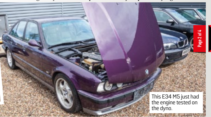
This E34 M5 just had the engine tested on the dyno.